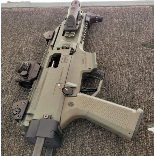
CZ Scorpion 9mm

Seen at the Range! This section is getting more popular every month! Check out this incredibly rare, and accurate Springfield Trapdoor model 1871, in 45-70, made in 1881! The CZ Scorpion 9mm and for the long-range bench rest precision shooters, take a look at the Defiance 6.5 Creedmoor with a Kelbly stock! Introduce yourself to the shooter at the next bench. You might be surprised what you can learn and maybe make a new friend! At left is the Springfield 1879 Trapdoor, 45-70, made in 1881.