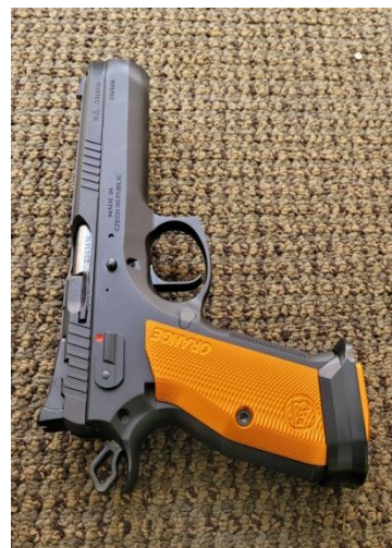
CZ 75 in 40 cal.