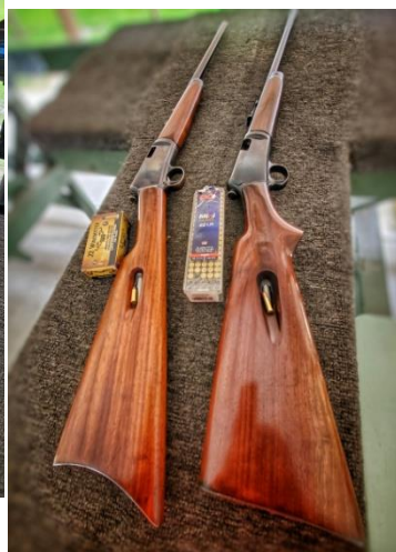
Winchester 1903 & 63