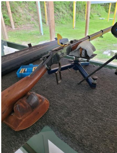
Winchester 1873 in 44-40

Seen at the Range! This section is getting more popular every month! From these beautiful classic Winchesters to the eye-catching CZ-75 there are a lot of interesting guns at our range. Introduce yourself to the shooter at the next bench. You might be surprised what you can learn and maybe make a new friend!